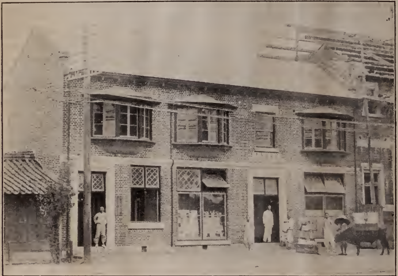
Korean Religious Tract Society †

having secured a valuable aid to their work in so commanding a position in Seoul. With regard to the present financial position of the society, at the end of May, 1911, the assets exceeded the liabilities by 5,287.73* yen including a cash balance of 1,992.30 yen . Tho the Tract House is complete the special building fund is not in a position to make the final payment of 500 yen to the contractor nor is it possible to furnish several of the rooms owing to the lack of money tho they are urgently needed for translation and proof reading purposes. It is generally hoped that friends will soon come forward with at least 1,000 yen to equip these central and commodious offices.